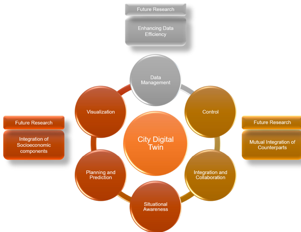
Figure 3. Advancement of the city digital twin's potentials.